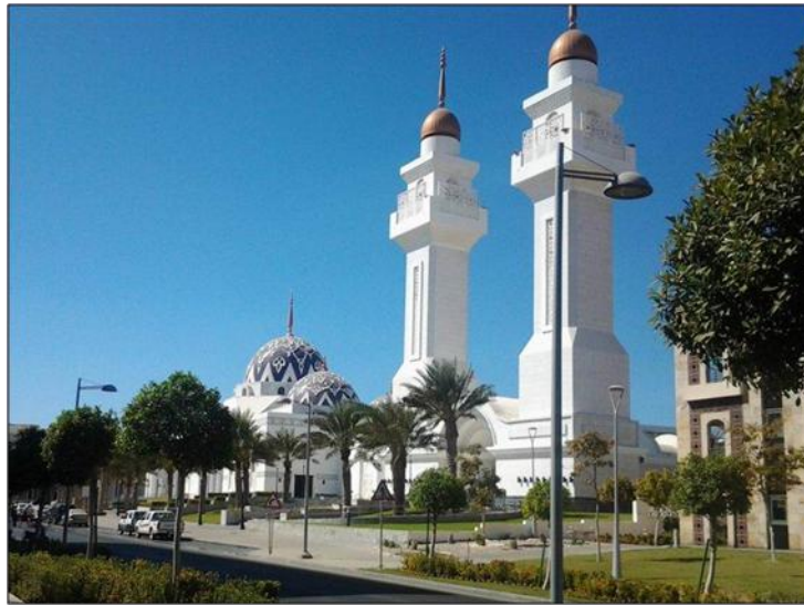
King Abdullah Grand Mosque, KAUST

At the same time, the Call to Prayer drifts across our campus five times a day from five different mosques. In our schools, children also learn Arabic and Islamic Civilization. Food on campus is prepared according to Islamic custom. Some people may very well head to the beach or to the pool in swim wear; but women also choose to dress in the traditional black abaya and hijab. Some opt to swim in our 'Women Only' pool, much like how Queen Victoria used to take to the waters in Bognor just about a century ago.