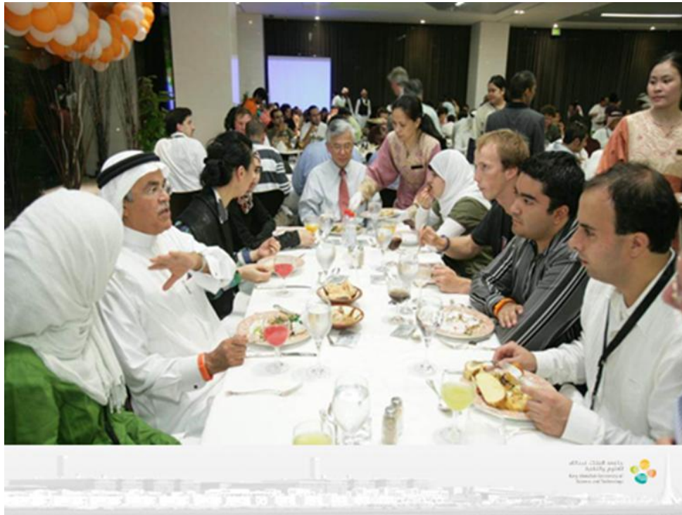
Iftar (breaking of the fast during Ramadan) with students, faculty and staff.

Some people said: “No wonder you’re going to Saudi Arabia. You have a fresh start. They’re giving you a blank check and a blank page.”