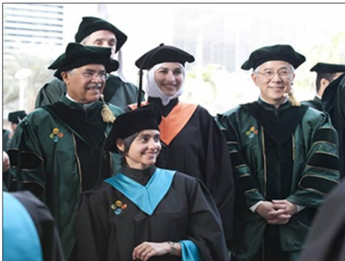
Inaugural Commencement December 2010

When the Custodian of the Two Holy Mosques, King Abdullah bin Abdulaziz al Saud, first gave me an audience in 2008 in his Royal Court, he shared with me his long-held dream. He envisioned a university that would rekindle the Golden Age of Islamic Civilization, together with its great traditions of learning and scholarship. This graduate research university of science and technology was to be a gift to the Kingdom and to the world. More than that, the King wanted it to be a 'living gift' to benefit future generations in the Kingdom and beyond.